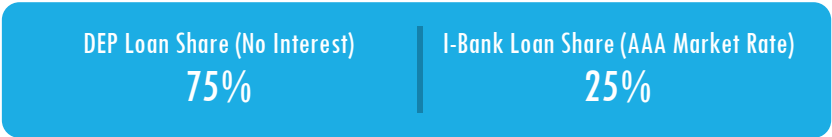
Funding Package for CSO Abatement/Affordability with PF for the first $5M

The DEP is reserving additional funds and providing additional principal forgiveness loans exclusively for CSO abatement projects in communities that meet the CWSRF Affordability Criteria. Principal forgiveness funds will be allocated to CSO Abatement/Affordability (CSO/A) projects on a readiness to proceed basis. Project sponsors are eligible to receive 100% principal forgiveness for the first $5 million of allowable project costs and loan funding with a blended interest rate of 50% of the I-Bank AAA Market Interest Rate for allowable project costs between $5 million and $10 million. The DEP Fee is waived for the principal forgiveness portion of CSO/Affordability loans. There is a total applicant principal forgiveness cap of $5 million for CSO Abatement projects and CSO Abatement/Affordability projects in SFY24. For example, an applicant is awarded $5 million under the CSO Abatement/Affordability category would be limited by the cap and not eligible for additional principal forgiveness under the CSO Abatement principal forgiveness category in SFY24.