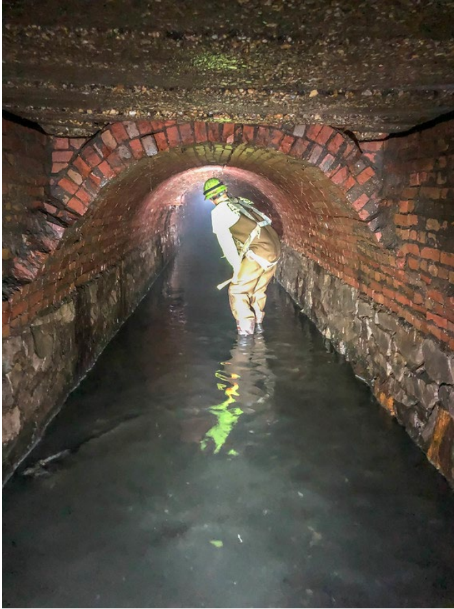
Camden County Municipal Utilities Authority Clean Water Project