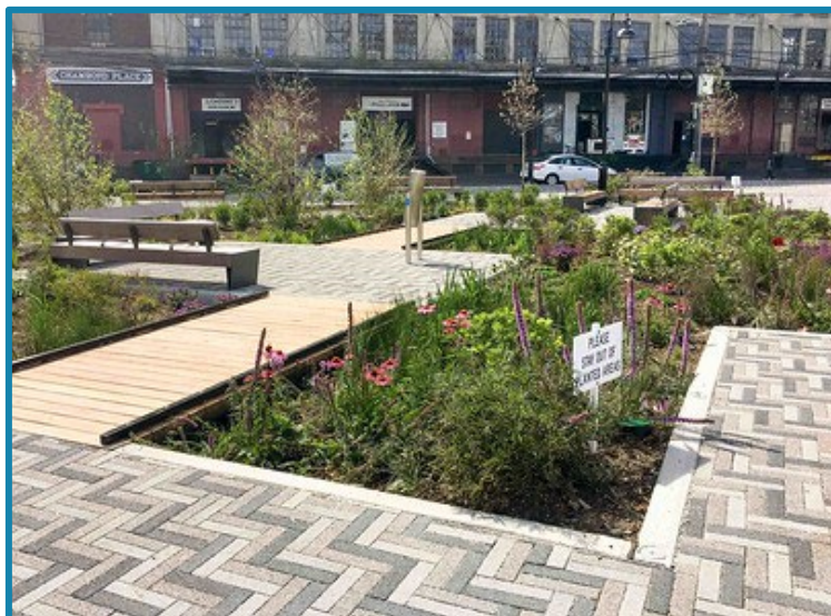
Hoboken City Clean Water Project, Southwest Park & Underground Retention System

Green projects are clean water projects that incorporate green infrastructure and water or energy efficiency improvements* (those that reduce greenhouse gas emissions, for example). Green infrastructure includes such practices as replacing existing pavement with porous pavement, utilizing bioretention, renewable energy, constructing green roofs, creating rain gardens, and other practices that restore natural hydrology and treat stormwater runoff through infiltration into the subsoil, treatment by vegetation or soil, or stored for reuse.