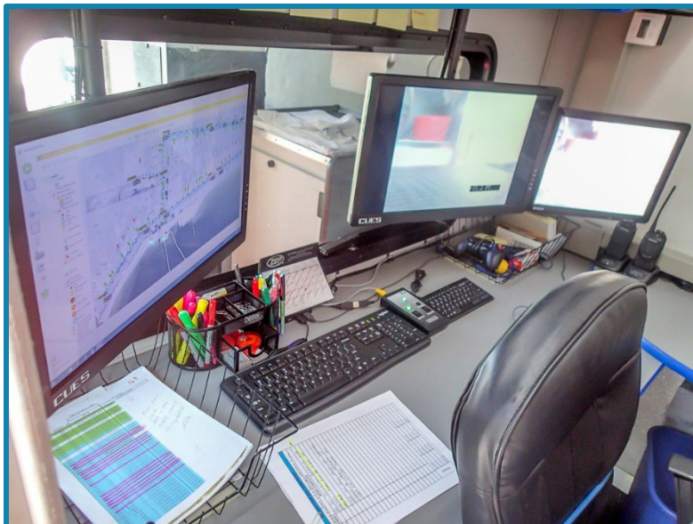
Toms River Municipal Utilities Authority Equipment Purchase