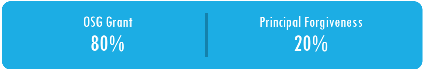
Funding Package for OSG Grant up to $1M in Project Costs

Project sponsors that receive a Sewer Overflow and Stormwater Reuse Grant for up to 80% of eligible project costs are eligible to receive a principal forgiveness loan for the remaining 20% of costs. Disadvantaged communities are eligible to receive OSG grant funding for up to 100% of eligible project costs. The DEP Fee is waived for the principal forgiveness portion of OSG loans. Total project costs are capped at $1 million. Approximately $2 million will be reserved for OSG CWSRF PF loans. The balance of the project would have to be separately funded and would be eligible for SRF funds at the rates offered for the applicable project type as indicated in this IUP.