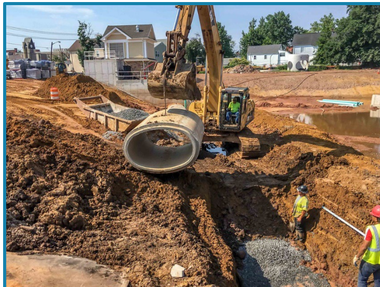
Borough of Carteret Stormwater Resiliency Project