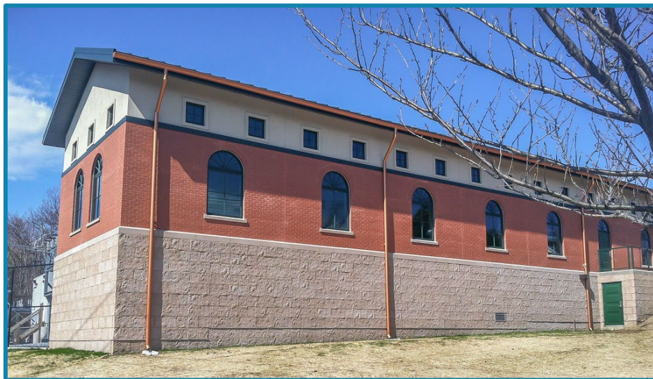
Milltown Borough Electrical Substation Relocation