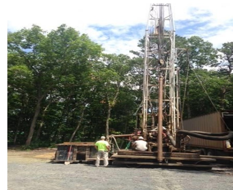
Drilling of a Drinking Water Well at the Berkeley Twp. MUA