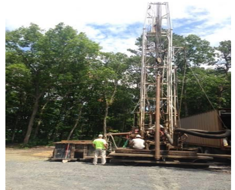
Drilling of a Drinking Water Well at the Berkeley Twp. MUA