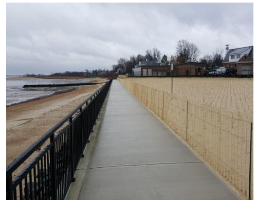
Old Bridge MUA Laurence Harbor Bulkhead and Walkway