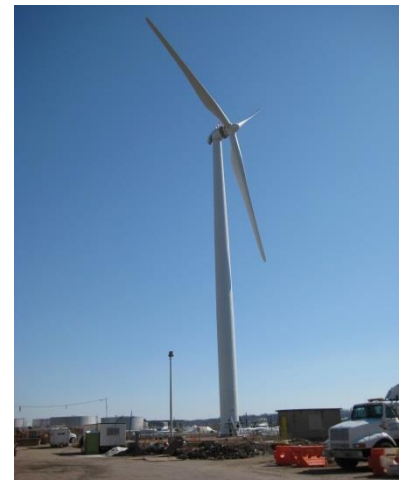
Bayonne MUA Wind Turbine for a Pump Station