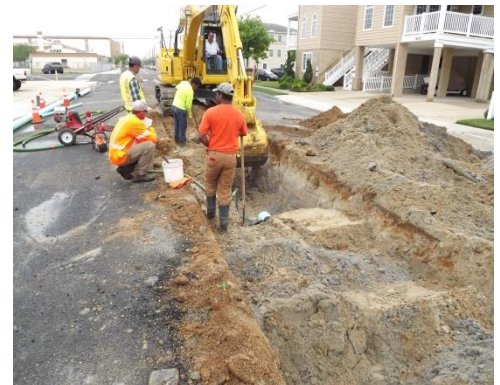
North Wildwood Sewer, Storm and Street Restoration