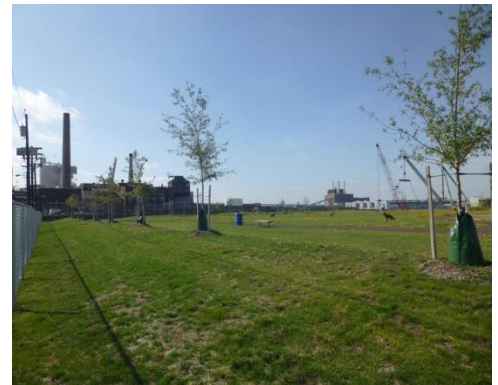
Camden County Phoenix Park