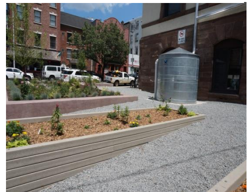
Hoboken City Green Infrastructure