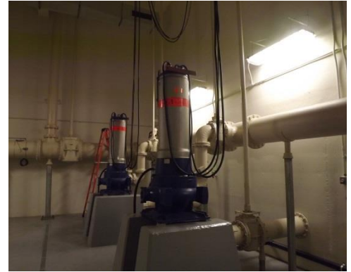
Camden County MUA Pump Station

NJEIFP provides financing for the preservation of open space and farmland given the water quality benefit achieved through such acquisitions. The Program funds preservation with regard to properties protecting stream headwaters and corridors, wetlands, and aquifer recharge areas. Financing for land is compatible with the Green Acres Program, the Garden State Preservation Trust, and Open Space programs financed by local and county Open Space taxes.