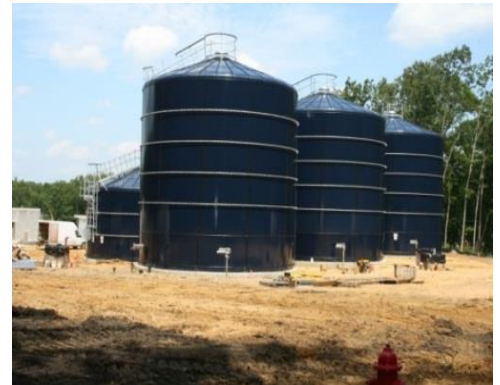
Construction of Storage Tanks at the Jackson Twp. MUA

For information regarding permitting, see: