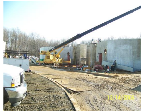
Mount Laurel MUA Elbo Lane Water Treatment Plant