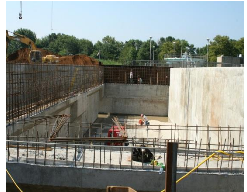
Township of Middletown Sanitary Authority Aeration Digester