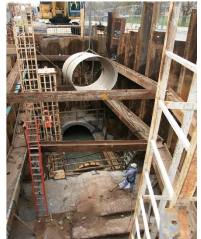
Passaic Valley Sewerage Commission Interceptor Slip Lining