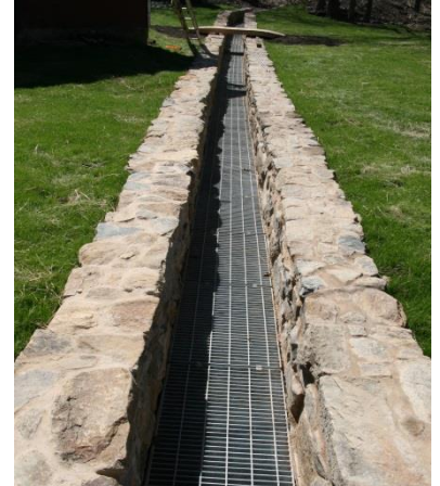
Califon Storm Water Improvements

Public community water systems, both privately and publicly owned, and nonprofit non-community water systems (as defined by the National Primary Drinking Water Regulations) are eligible for NJEIFP assistance. Public community water systems owned by water commissions, water supply authorities, and water districts are also eligible. Federally owned systems and State-owned systems (State agencies, such as State Police, Parks and Forestry, and Corrections) are not eligible to receive NJEIFP assistance.