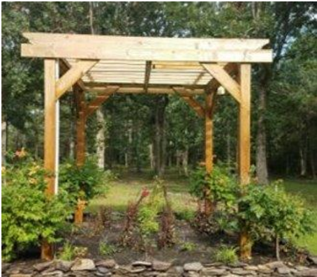
Pineland Interpretive Center