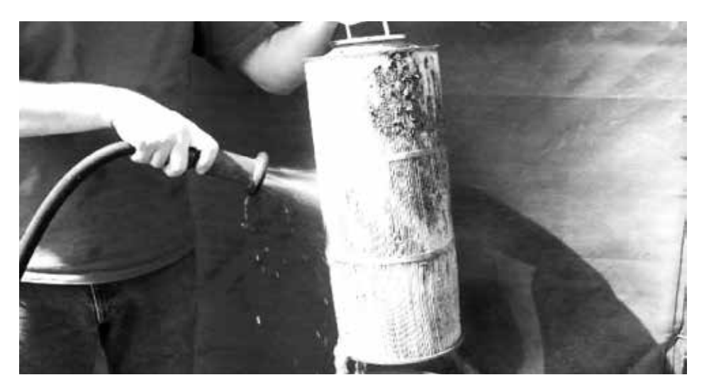
4. To wash cartridges, remove from vault. Place over trash can and use a garden hose to spray clean.