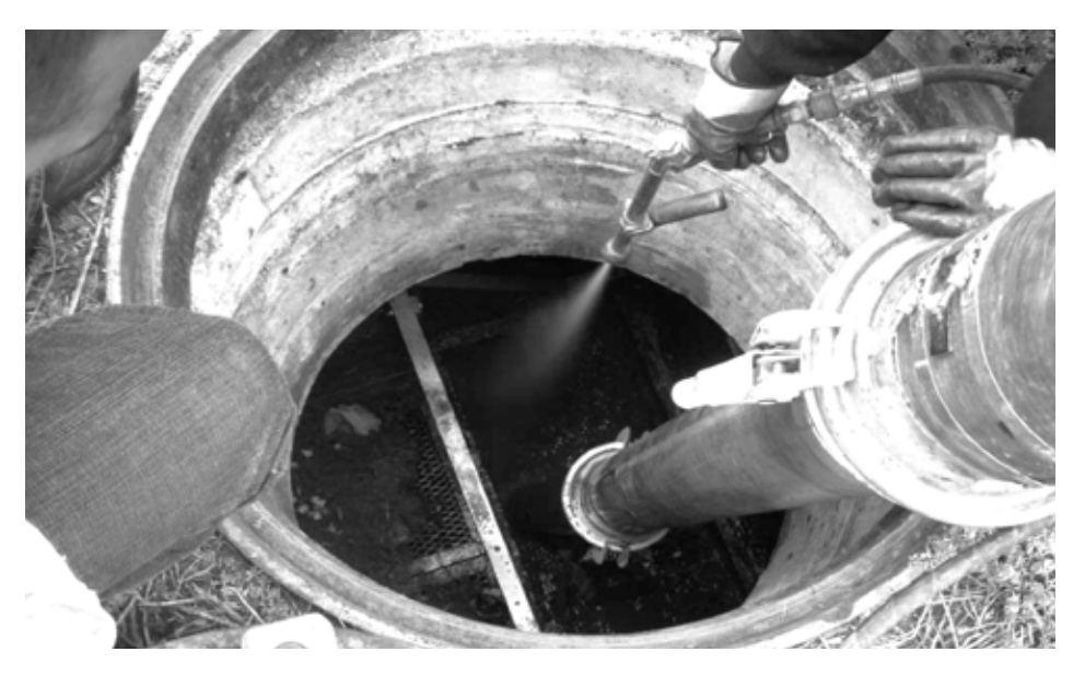
2. Insert vacuum hose in the sedimentation chamber and vacuum out all trash, sediment and standing water.