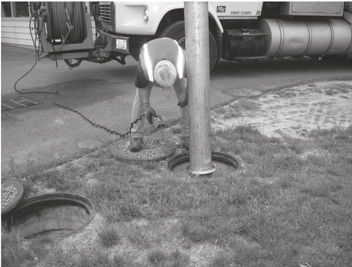
A Cascade Separator unit can be easily cleaned in less than 30 minutes.