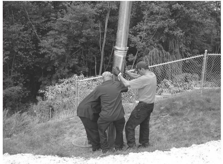
A vacuum truck excavates pollutants from the systems.