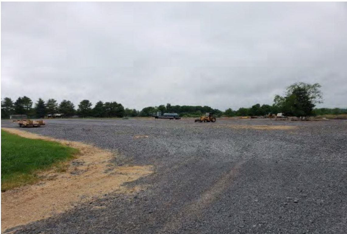
Photo 2: Taken facing southwest of existing gravel lot. Branchburg, Somerset County, NJ.