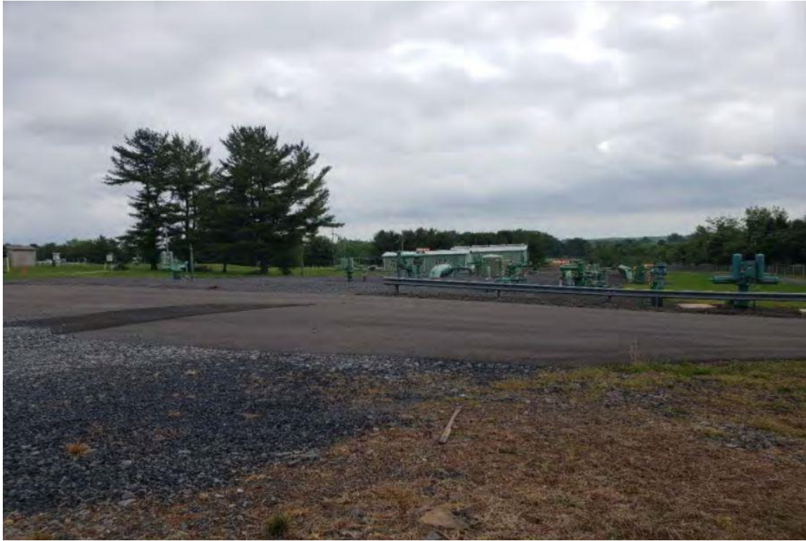
Photo 5: Taken facing northwest of the existing facility. Branchburg, Somerset County, NJ.