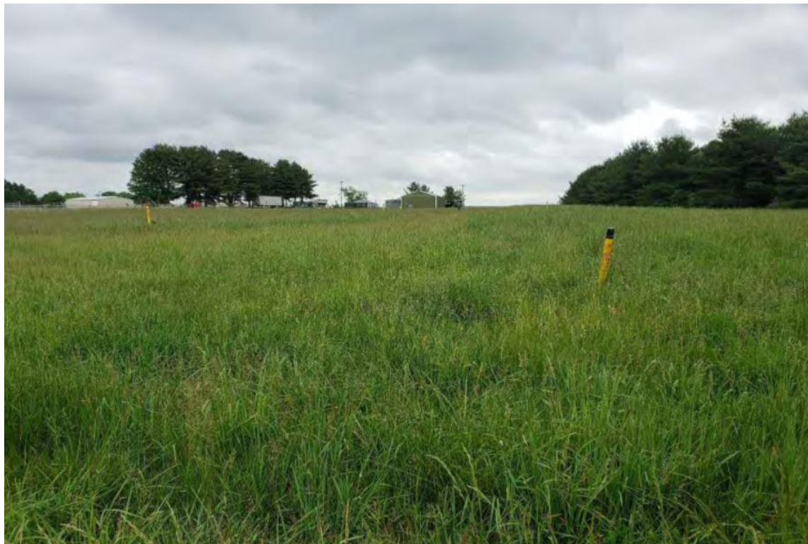
Photo 4: Taken facing east toward existing facility. Branchburg, Somerset County, NJ.