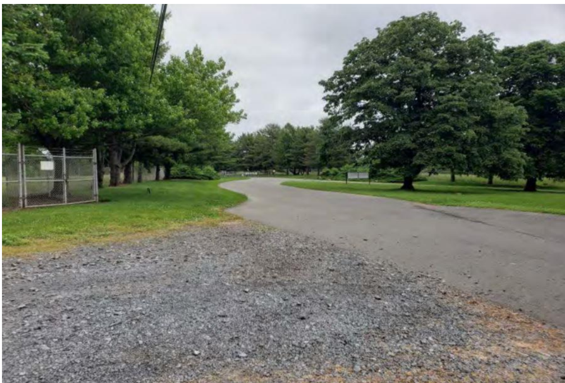
Photo 3: Taken facing northeast of existing facility entrance. Branchburg, Somerset County, NJ.