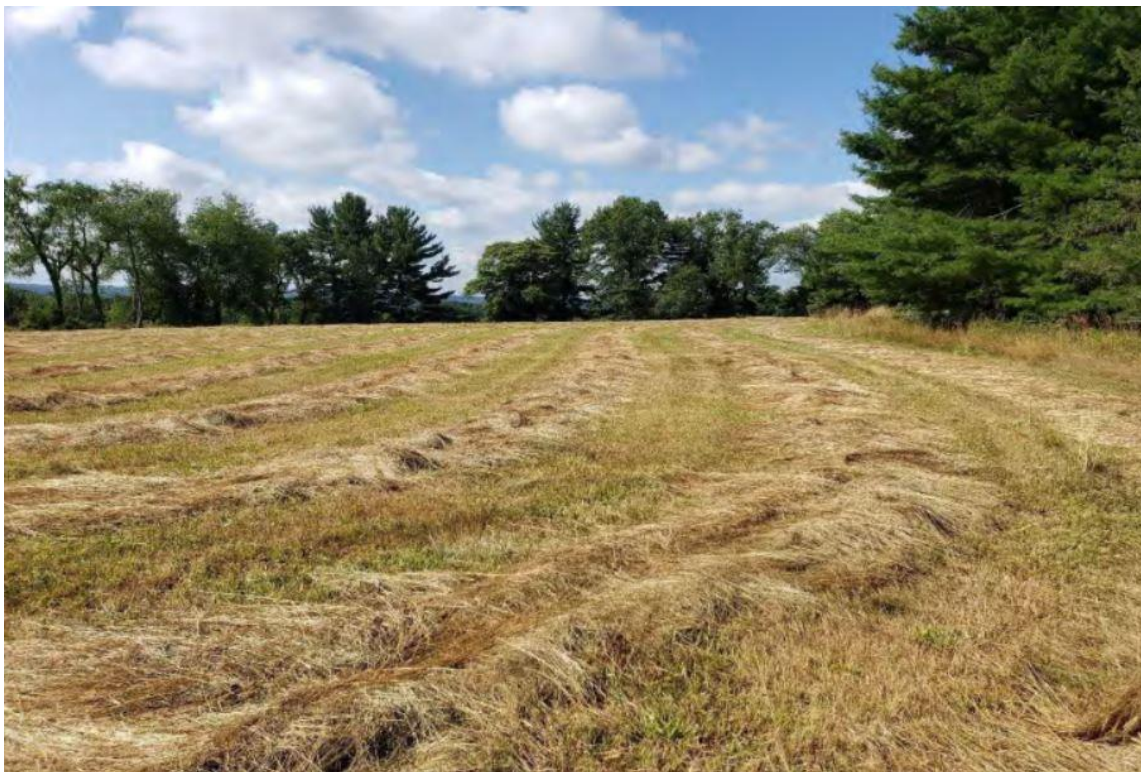
Photo 1: Taken facing south of upland agricultural field near site entrance. Branchburg, Somerset County, NJ.