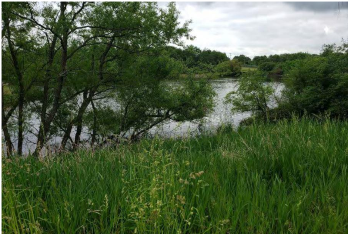
Photo 6: Taken facing southeast of pond in southeastern corner of site. Branchburg, Somerset County, NJ.