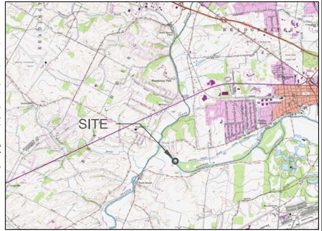
SITE LOCATION MAP NOT TO SCALE