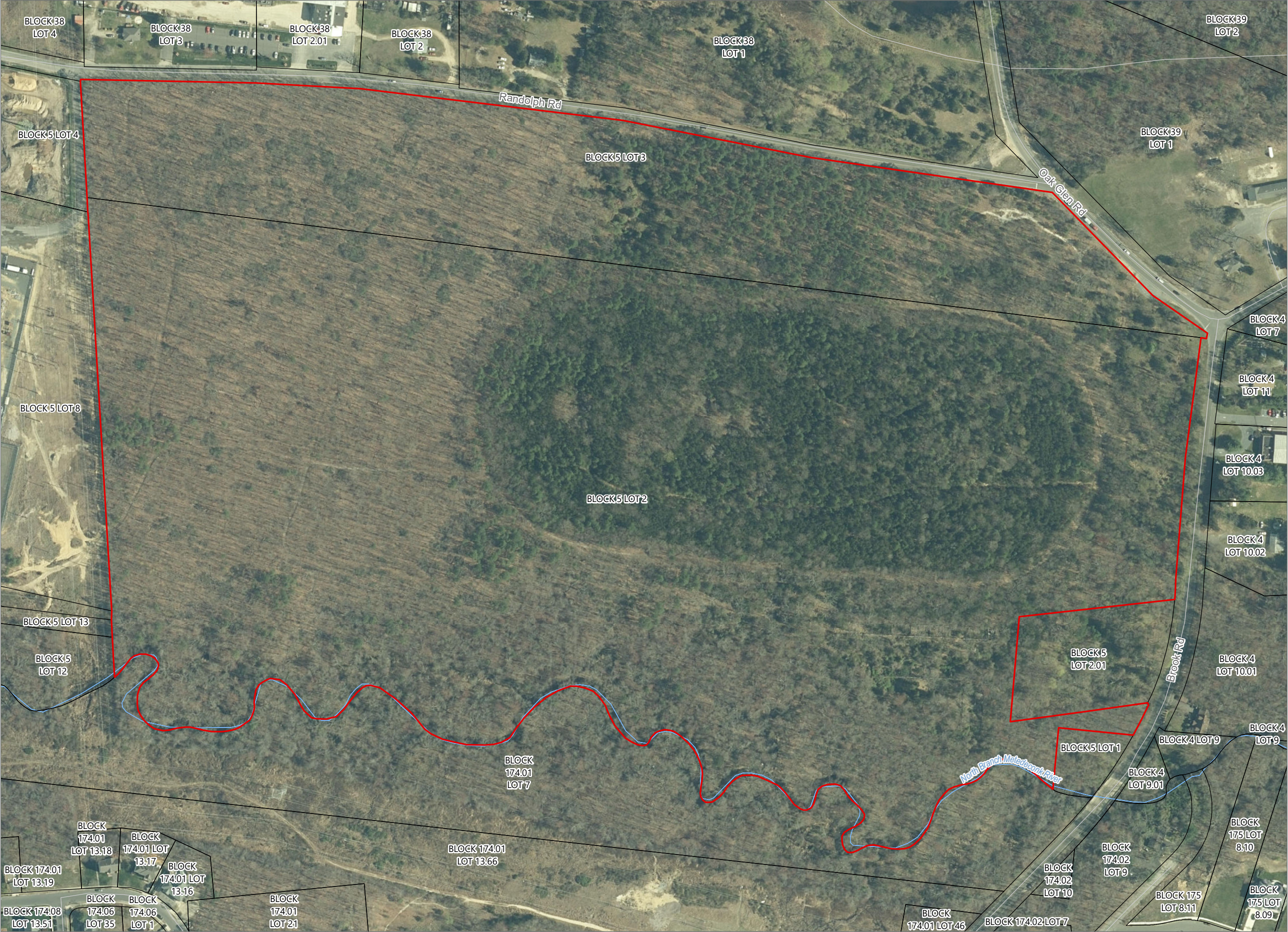
Figure 2. Tax Map