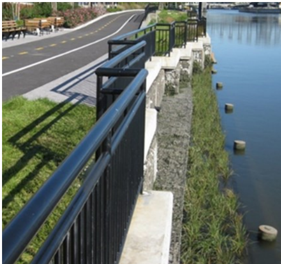
Above: Harlem River Park (NYC) introduced curvature as seen by the shape of the fencing and terracing at the water's edge.

New Jersey's Coastal Zone Management Rules define a living shoreline as a "shoreline management practice that addresses the loss of vegetated shorelines, beaches, and habitat in the littoral zone by providing for the protection, restoration or enhancement of these habitats" (N.J.A.C. 7:7-1.5). An urban ecoshoreline is a type of living shoreline with the key constraint of space. Urban infrastructure limits habitat development in these areas and, therefore, requires creative design principles to support project success.