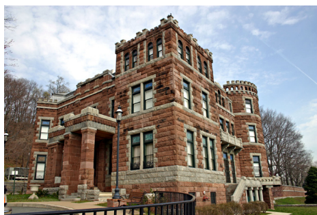
Figure 9. Lambert Castle, located in Paterson, was built with a brownstone exterior in 1893 by wealthy silk manufacturer, art collector, and amateur architect Catholina Lambert. (Z. Allen-Lafayette, 2006).

Brownstone quarries in thick beds at Little Falls in Passaic County produced a superior, fine-grained red building stone from the Passaic Formation. The sandstone was dubbed “liver rock” by