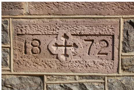
Figure 15. St. Mary's Church brownstone cornerstone with date. (Z. Allen-Lafayette, 2006).

smaller scale (Yolton, 1960) with most brownstone now going into foundation work and windowsills of buildings (figs. 13, 14, 15).