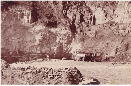
Figure 4. Wagon for removal of stone in sandstone quarry, Upper Montclair, N.J..

Quarrying technology continually improved throughout the brownstone era. Machines were used after the late nineteenth century (Guinness, 2002). Figure 3 shows mechanical equipment used to quarry brownstone.