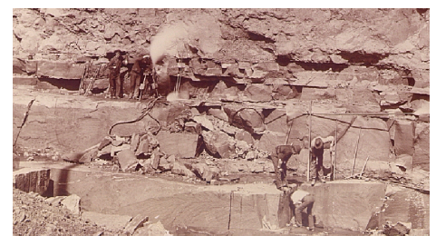
Figure 3. Channeling and wedging with power equipment at a brownstone quarry in Upper Montclair, N.J. (NJGWS Archives).

because it was cheaper and easier than channeling and wedging. The drawback of blasting brownstone was that more stone was lost. Most of the time, blasting was only used when quarrying for rubble and stone for cellar walls (“The Manufacturer and Builder”, 1891).