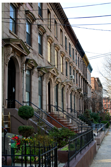
Figure 10. Brownstone fronted row houses, Van Vorst Park, Jersey City. (Z. Allen-Lafayette, 2006).

local workmen, due to its deep, rich color (Yolton, 1960). Shipped via the Morris Canal, this stone was used in the construction of mansions and churches in Paterson, Newark and New York City (fig. 9).