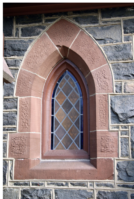
Figure 14. St. Mary’s Church brownstone trimmed window. (Z. Allen-Lafayette, 2006).