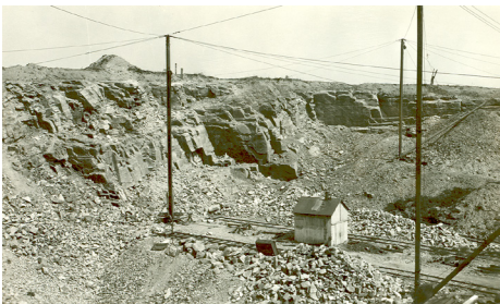
Figure 5. Raven Rock Brownstone Quarry with narrow gauge railroad and derricks, Delaware Township, Hunterdon County. May 19, 1932. (NJGWS Archives).

When it became available, steam power was used in the excavation and removal of stone from the quarry floor. Huge derricks were set up on promontories jutting into the quarries at right angles to the quarry face to remove the stone (fig. 5). The derricks would pivot around a base so that nearly every