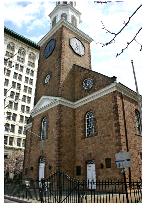
Figure 8. Old First Presbyterian Church, Newark. (Z. Allen-Lafayette, 2006).

Brownstone quarried from the Passaic Formation near Newark provided the building stone for the Old First Presbyterian Church in