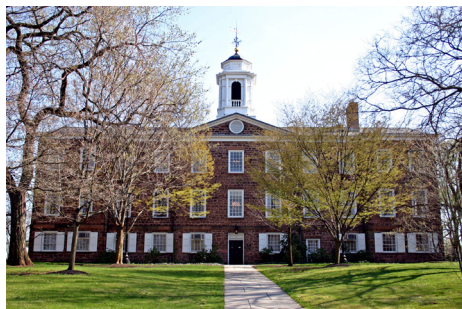
Figure 11. Old Queens, Rutgers University, New Brunswick. (Z. Allen-Lafayette, 2006).

Quarries in the Passaic Formation in Belleville near Newark, however, were the most productive, supplying more material for the fronts of brownstone houses (fig.10) than any other source in the country (Yolton, 1960). A light chocolate-brown sandstone from the area was noted for its quality to rub down to a smooth surface. Old Queens, completed in 1809 at Rutgers University (fig. 11), was built of Belleville brownstone from the Passaic Formation.