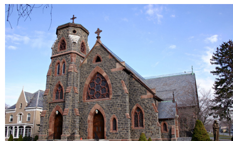
Figure 13. St. Mary’s Church in Wharton Boro, Morris County, was designed by Jeremiah O’Rourke, and erected in 1872. The church is unusual for the use of local mined stone, Little Falls brownstone trimmings, open truss roof, and pre-opalescent glass (N.J. Historic Trust). (Z. Allen-Lafayette, 2006).

By the turn of the twentieth century, quarrying was on a much