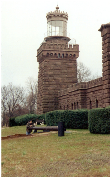
Figure 12. The Navesink Twin Lights lighthouse south tower in Highlands Boro. The lighthouse sits 200 feet above the Atlantic Ocean. (L. Pallis, 2006).

By the mid nineteenth-century, many of the quarries, especially in