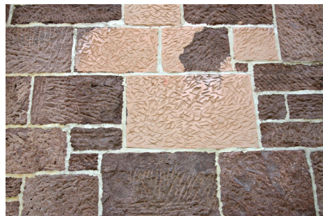
Figure 16. Repaired brownstone.

Proper façade maintenance specific to sandstone is critical to prevention of deterioration. Repairs may be complex and are best performed by a professional restorer (fig. 16).