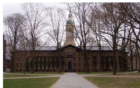
Figure 6. Nassau Hall, Princeton University. (T. Pallis, 2006).

In colonial times the Stockton Formation was recognized as the