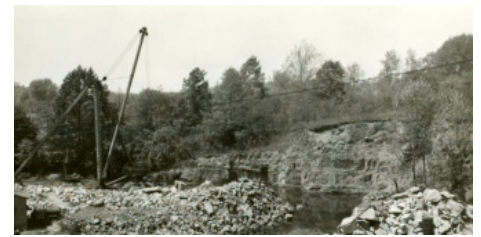
Figure 7. Derrick at the De Flesco Brothers Quarry, Wilburtha, Ewing Township. One of many central New Jersey Brownstone quarries. May 20, 1932. (NJGWS Archives).

During the first half of the nineteenth century, sandstone quarries