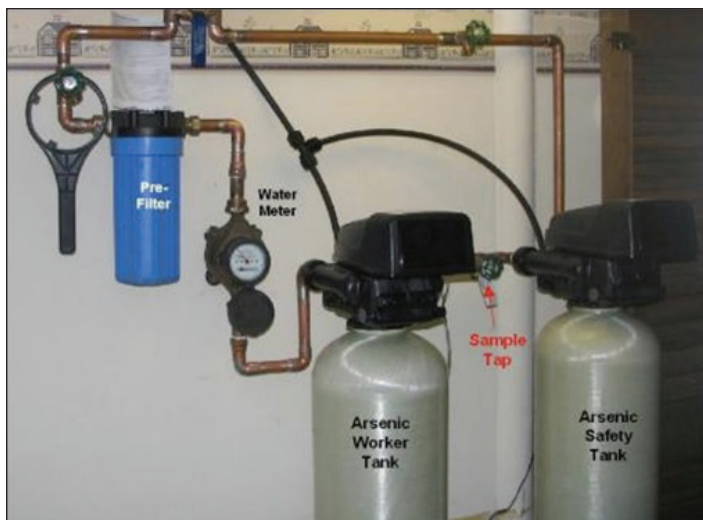
Figure 4. A whole house arsenic water treatment system with worker and safety tank showing location of sample tap between the tanks.