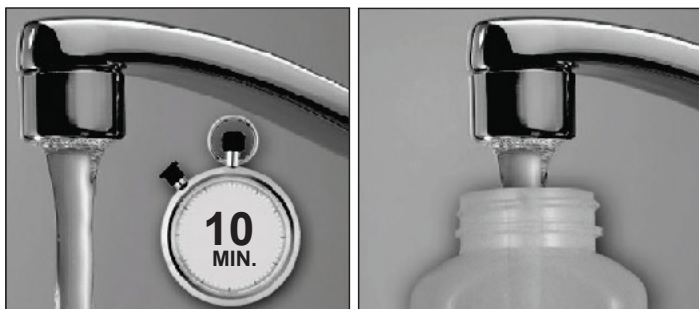
Figure 3. Run water for 10 minutes before collecting a water sample.

media installed in the treatment tanks (pH adjustment media instead of arsenic treatment media). Good installations have been observed to not remove any arsenic for an entire year because of incorrect settings on the bypass valves. Hence the importance of the initial after-installation test.