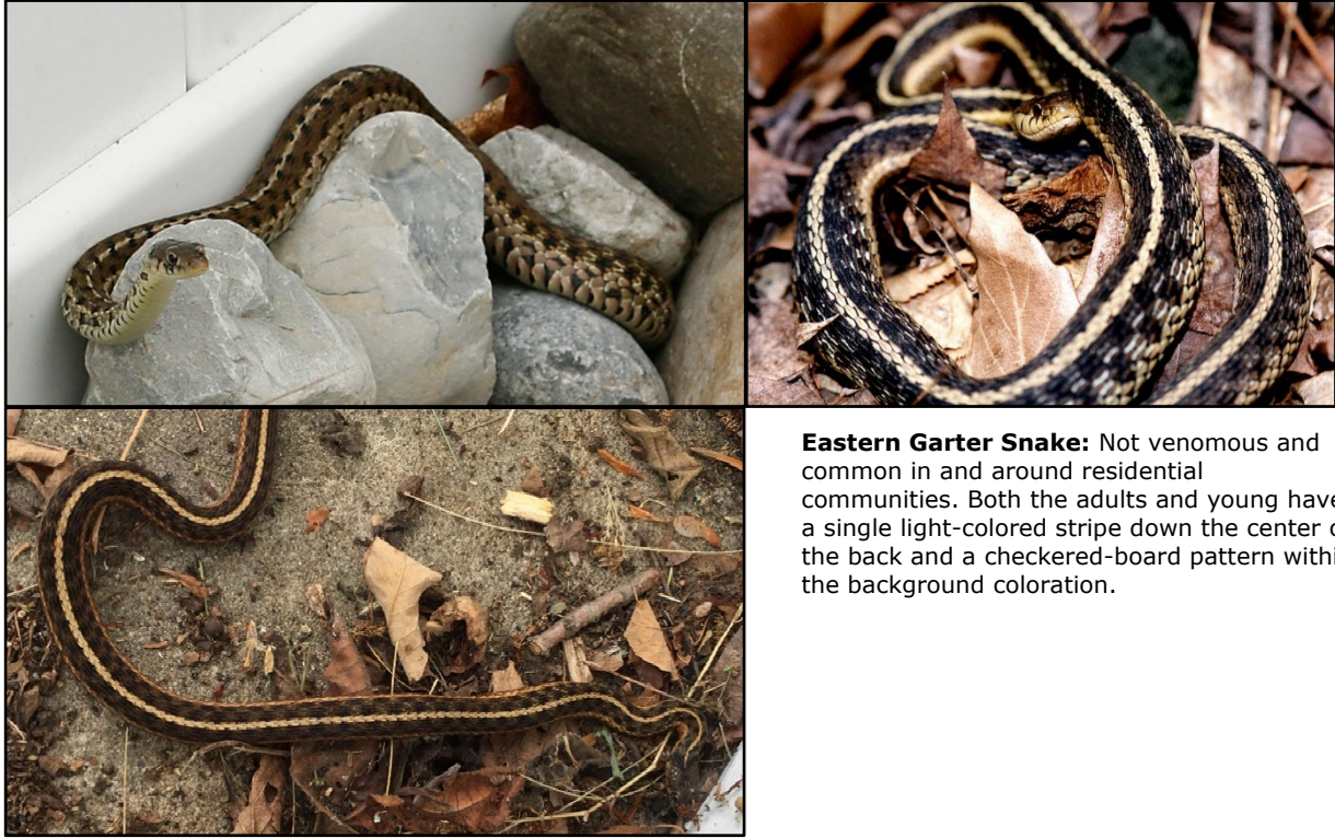
Eastern Garter Snake: Not venomous and common in and around residential communities. Both the adults and young have a single light-colored stripe down the center of the back and a checkered-board pattern within the background coloration.

This document is not meant to be used as the definitive guide to New Jersey's snakes, but below are two species that often give residents and visitors pause: