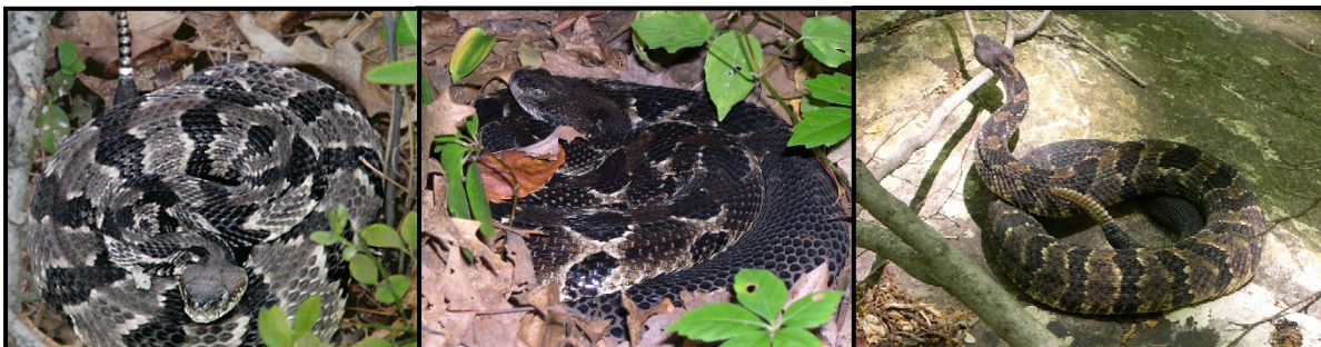
Examples of "black" or "dark" phase rattlesnakes.