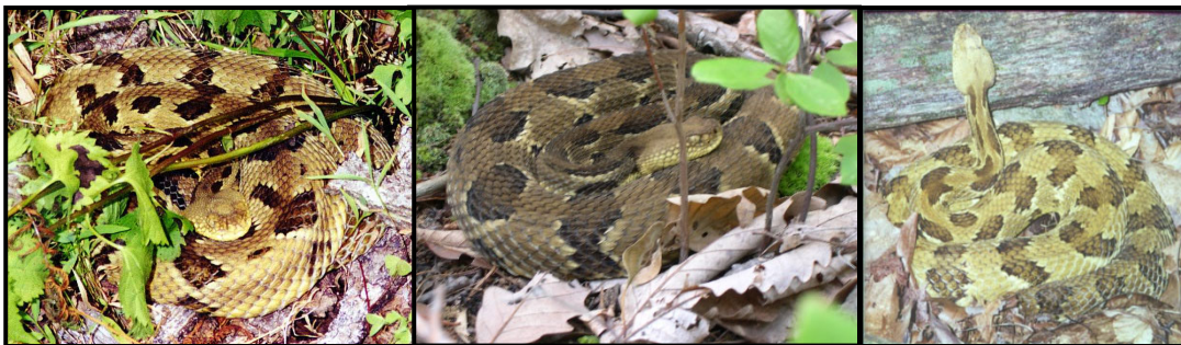
Examples of "yellow" or "light" phase rattlesnakes.