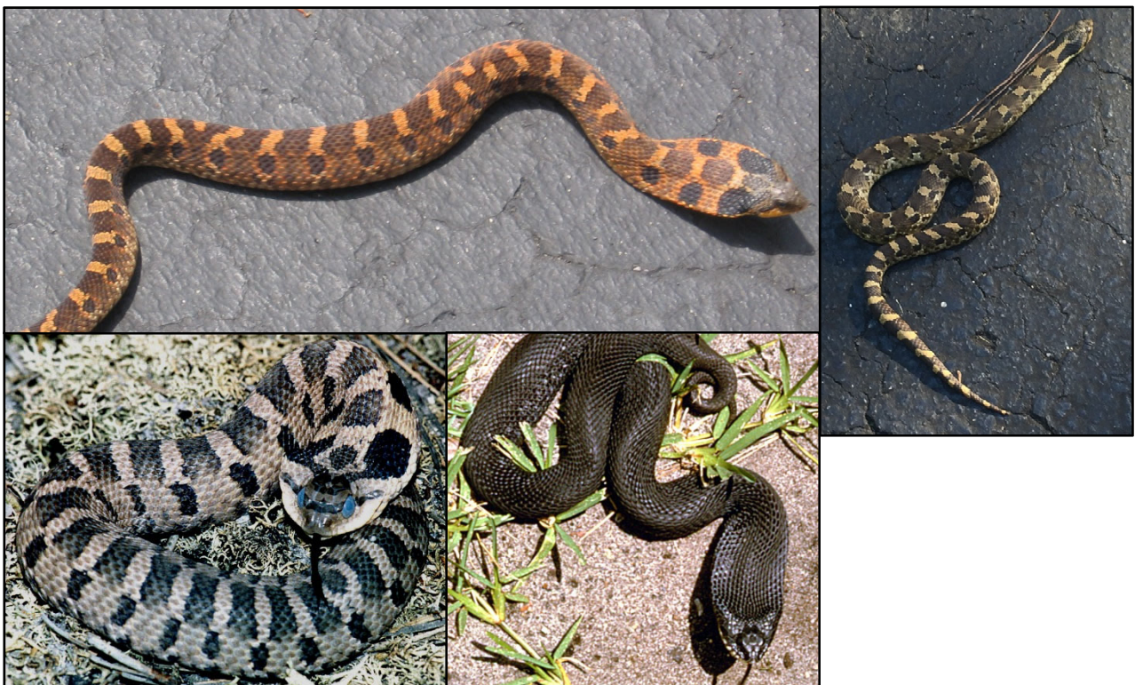
Eastern Hognose Snake: Not venomous. Hognose snakes are either patterned or solid black for life. If patterned, both the adults and young snakes have a somewhat uniform rectangularly shaped pattern (the darker color). This snake also has an upturned snout which helps them create a pocket in the soil to lay their eggs. Unlike any other New Jersey snakes, this one will often play dead when feeling threatened, rolling over, emitting a foul odor, and sometimes even allowing its tongue to hang from its mouth.