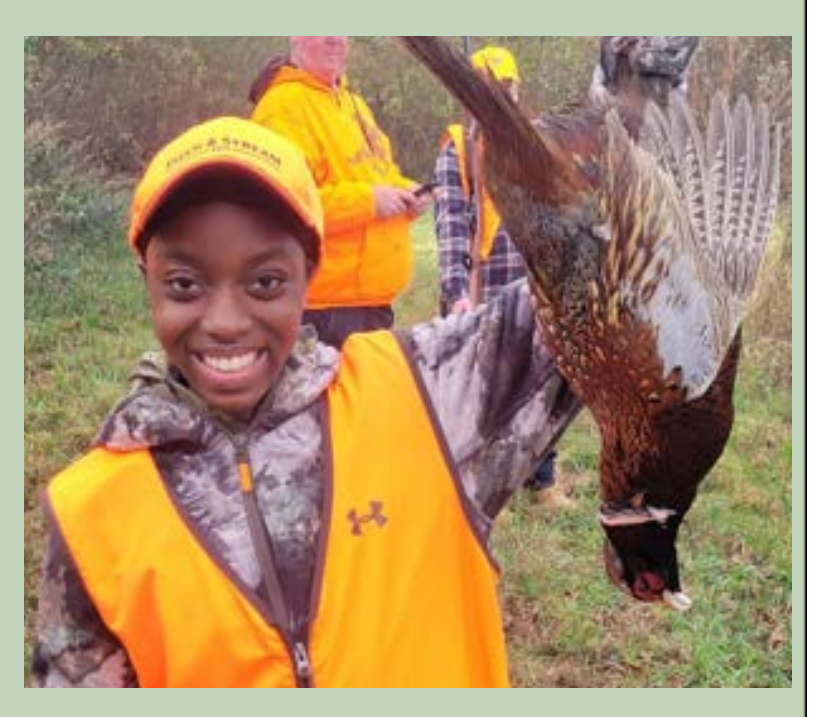
Happy Hunter with one of our 55,000 stocked R3 pheasants