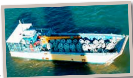
In the shadow of Old Barney —Captured from atop the lighthouse as it passed by, landing craft Benjamin Maybe transports 50 reef balls to the Barnegat Light Reef.

New Jersey's Reef Program is recognized nationally as being the most progressive and served as the model for other states now active in constructing artificial reefs. Our Program has reefed more vessels and deployed a greater volume of materials than any other state in the nation, an amazing statistic given the size of New Jersey compared with other states having an active reef program such as Florida, California and North Carolina.