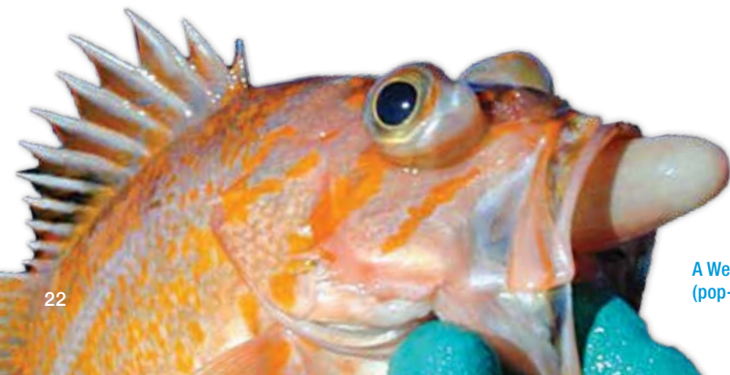
A West Coast canary rockfish with barotrauma effects (pop-eyes and protruding stomach)

Studies on West Coast rockfish have demonstrated high survival rates for descended fish. Some fish have survived the barotrauma effects of being caught from hundreds of feet below the surface. An entertaining and very informative video on this subject can be found on YouTube at https://www.youtube.com/watch?v=EiZFghvOyI .