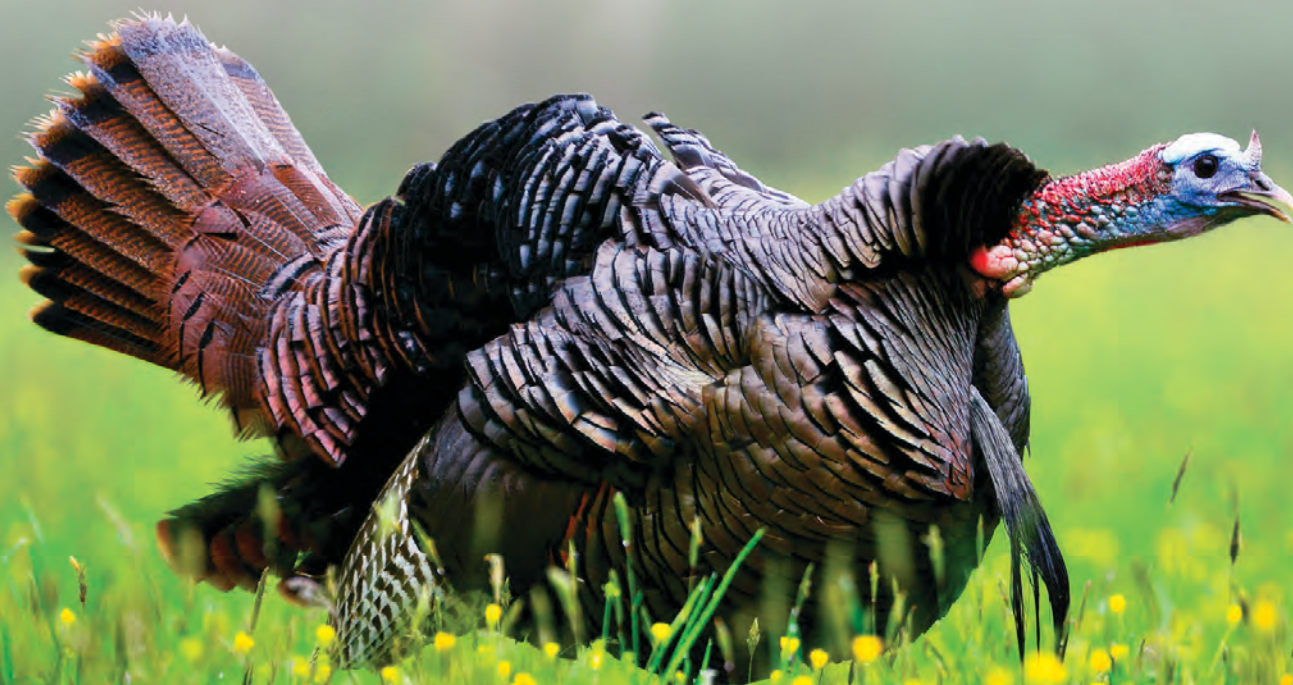
National Wild Turkey Federation

The latest turkey hunting techniques are presented at several turkey hunting seminars sponsored by NJDEP Fish & Wildlife or wildlife conservation organizations. These seminars focus on how to set up, calling techniques and key safety information for turkey hunters. New turkey hunters are especially encouraged to join us at a seminar. Check our website for seminars scheduled during March or April.