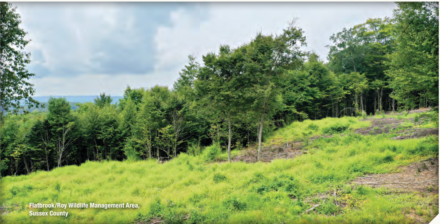
Flatbrook/Roy Wildlife Management Area, Sussex County