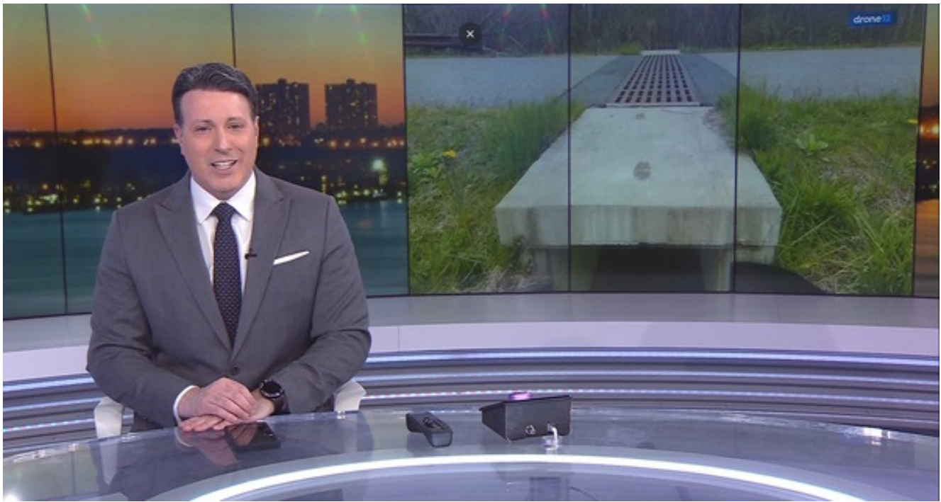
NJFW's wildlife tunnels featured on News 12 New Jersey, April 10th.

News 12 New Jersey reporter Jim Murdoch also picked up the story. In an encore interview, Golden described the goal of the Assunpink project and CHANJ, "to give wildlife a way to move through the landscape, unimpeded, and safely be able to utilize all this great space that New Jersey has worked to preserve."