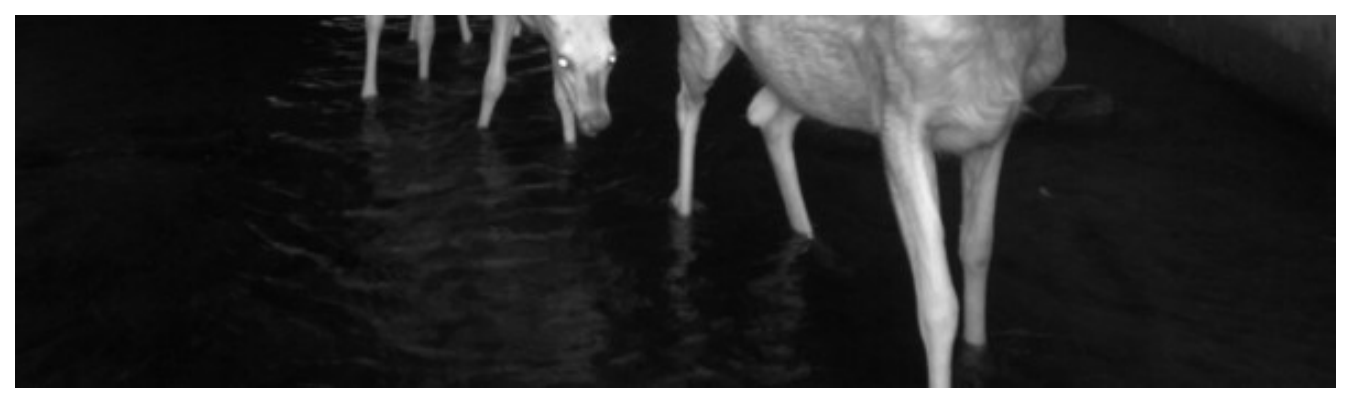
Not just about bobcats... Here, a doe and her fawns are caught on camera passing through a large box culvert.