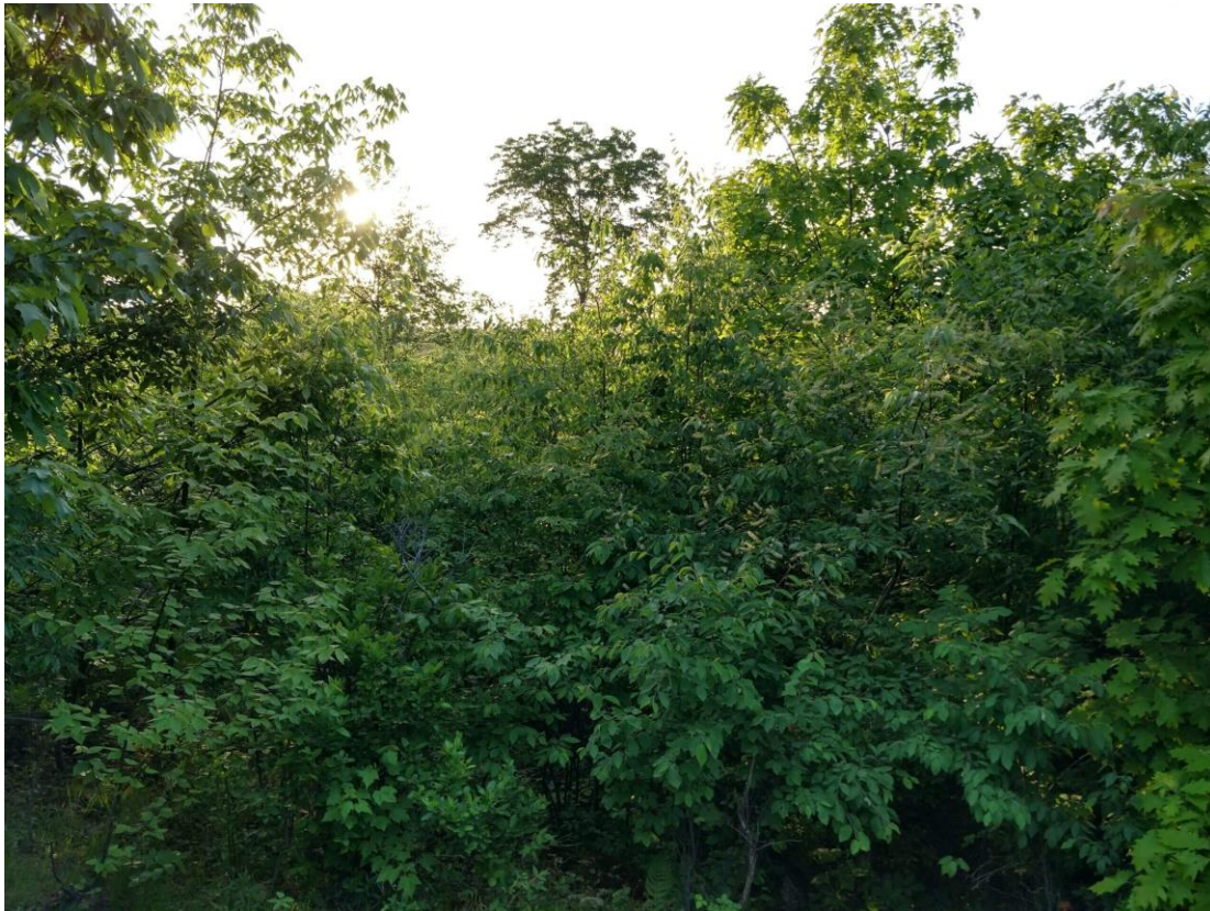
Photo taken 8 years, 3 months after treatment