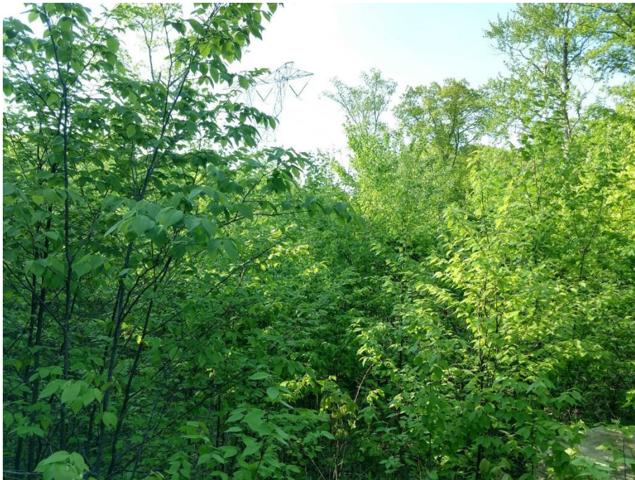
Photo taken 9 years, 3 months after treatment