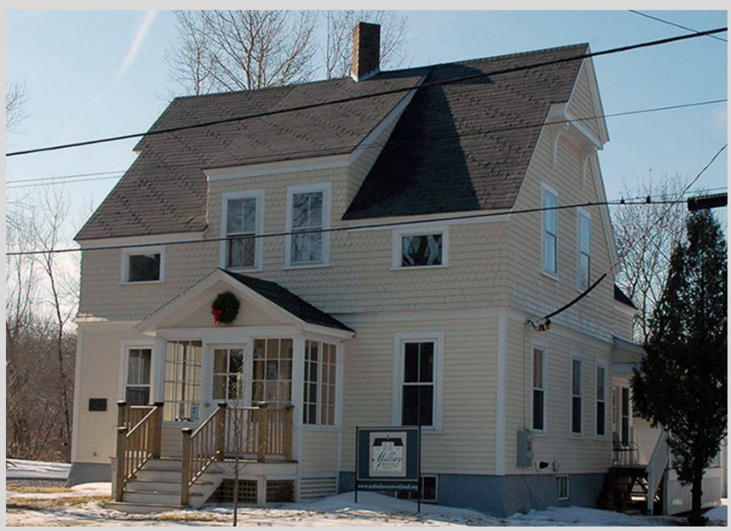
Singhi House, east and north facades, 2019.