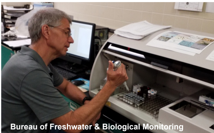
Bureau of Freshwater & Biological Monitoring