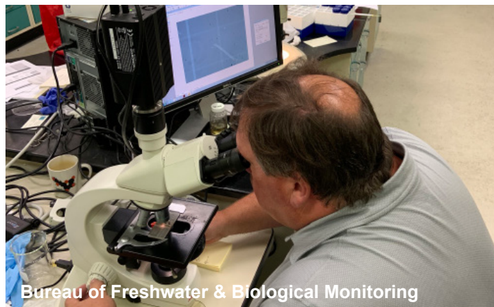
Bureau of Freshwater & Biological Monitoring

For questions regarding drinking water, please contact your local water supplier or NJDEP Division of Water Supply and Geoscience (609-292-7219) nj.gov/dep/watersupply