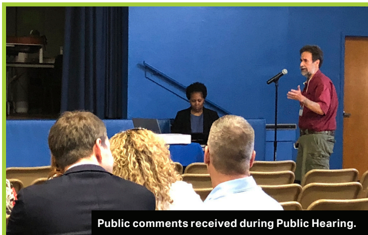
Public comments received during Public Hearing.