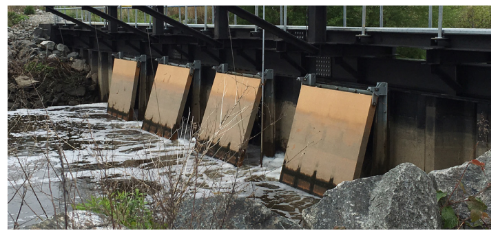
West Riser Tide Gate in Moonachie identified by the CAG as a Potential Project Concept Location

NJDEP and its Project Team appreciate the public feedback. We have prepared the Final Public Scoping Document and Final Public Scoping Summary Report based on the comments received. Both of these documents will be available to the public on <a href="https://www.rbd-meadowlands.nj.gov">www.rbd-meadowlands.nj.gov</a>.