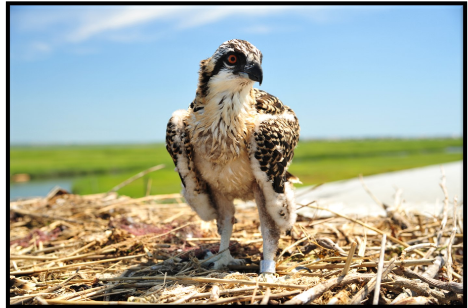
Osprey chick in Cape May County

In the late 19 th and early 20 th centuries, osprey populations were threatened by egg collectors and hunters. With the introduction of the pesticide DDT (dichloro-diphenyl-trichloroethane) in the 1950s, osprey populations declined sharply in many areas. The use of DDT may have accounted for the disappearance of up to 90% of breeding pairs from the Atlantic coast, between New York City and Boston. 2 Due to the banning of DDT in the early 1970s, along with the installation of artificial nest structures, reintroduction projects, and new habitat created alongside new reservoirs, osprey populations have largely rebounded and continue to increase. 3