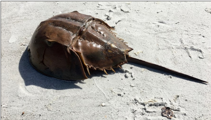
Adult Horseshoe Crab

Horseshoe crabs ( Limulus polyphemus ) are both ecologically and commercially important. They lay their eggs on sandy beaches in spring and summer, primarily during new and full moon cycles. Migrating shorebirds rely heavily on their eggs to supply energy required to complete their migration. Horseshoe crabs are also important to the medical industry. Biomedical companies catch horseshoe crabs for their blood, from which they produce Limulus Amebocyte Lysate (LAL). LAL is used to detect contamination of injectable drugs and implantable devices; it is the most sensitive means available for detecting endotoxins, which are part of the outer membrane of the cell wall of certain bacteria, such as E. coli and Salmonella . Finally, in some states horseshoe crabs are harvested commercially for bait to catch American eels, catfish, and whelk. New Jersey adopted a moratorium on the harvesting of horseshoe crabs in 2008, with an exception for the nonlethal collection of blood from horseshoe crabs for biomedical purposes. Horseshoe crabs are a particularly important species in New Jersey because the Delaware Bay is the center of horseshoe crab spawning abundance on the Atlantic coast. 1