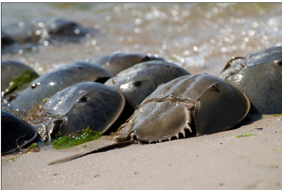
Spawning Horseshoe Crabs

Mispillion Harbor, DE, continues to be an important shorebird foraging area with very high egg densities. The harbor is protected in all weather conditions and may enjoy earlier, warmer water temperatures; both aspects favor horseshoe crab spawning.