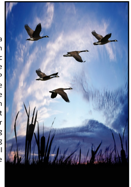
Canada geese.

Population estimates of AFRP Canada geese as measured by the Division of Fish and Wildlife during the spring Atlantic Flyway Breeding Waterfowl Survey are shown in Figure 1. In New Jersey, AFRP Canada geese increased rapidly during the 1990's and peaked during 2000 largely due to curtailment of hunting seasons in response to the poor status of migrant (Atlantic Population) Canada geese. After 2000, with the expansion of hunting opportunities, increases in nest and egg treatment, as well as round-up and cull operations, the population of AFRP geese has generally decreased.