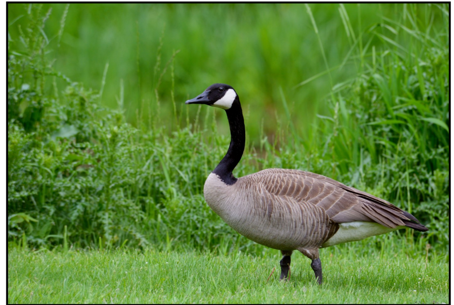
Canada goose.

AFRP Canada geese are non-migratory and usually begin nesting at three years of age. Pairs frequently stay together for life. In New Jersey, nesting occurs from late March through early May. Canada geese typically nest within 100 feet of open water, although they prefer islands, shorelines, and peninsulas. An egg is laid about every other day, and typical clutches are made up of four to seven eggs. If the nest or eggs are destroyed, geese will frequently renest.