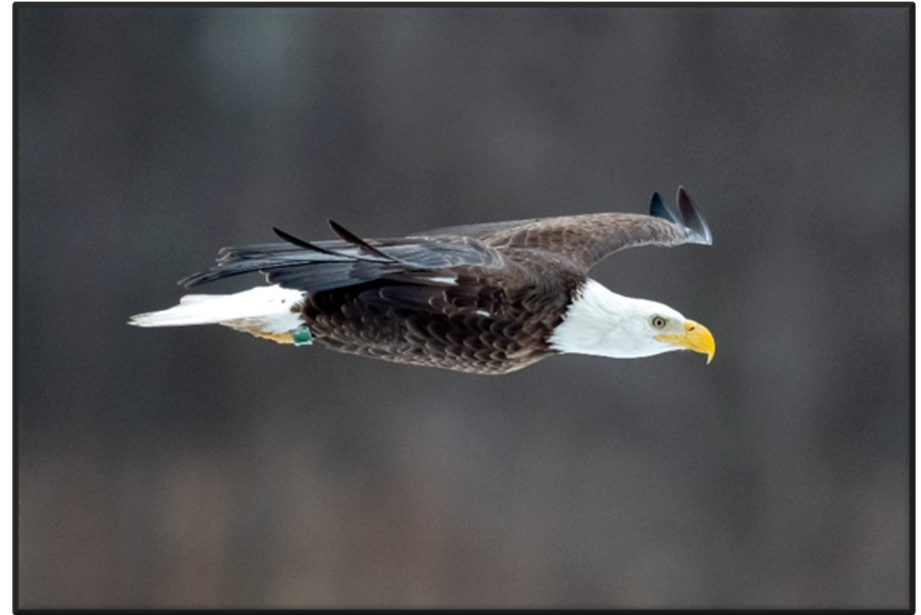
Bald Eagle at Mercer County Park

In 1972, DDT was banned in the United States, followed by bans of other pesticides such as aldrin, dieldrin, chlordane, toxaphene and PCBs in the late 1970s and early 1980s. 3 Subsequently, concentrations of these pollutants in the environment began to decline. At the same time, federal and state wildlife agencies instituted programs to protect and enhance bald eagle populations. The New Jersey Department of Environmental Protection Division of Fish and Wildlife, Endangered and Nongame Species Program (ENSP) coordinated the state’s efforts to restore bald eagle populations. From 1983 through 1990, ENSP monitored the release of 60 young eaglets obtained from Canada; it also coordinated intensive management of failing nests and protection of nesting sites by biologists and landowners.