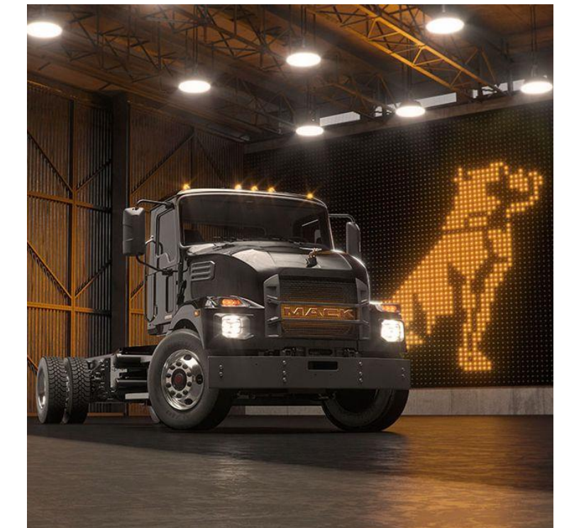
Mack MD Electric