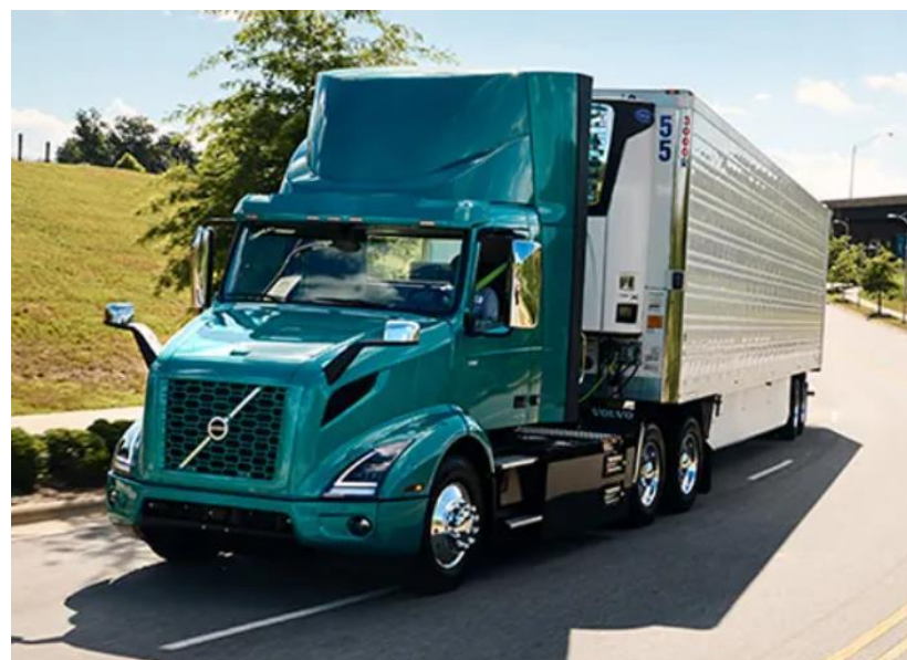
Volvo VNR Electric