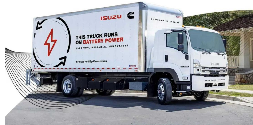
Isuzu Box Truck