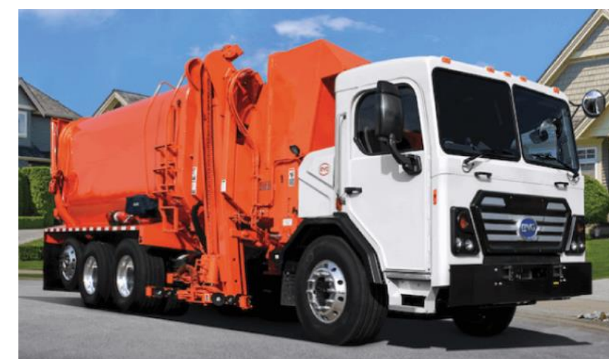
BYD 8R Refuse Truck