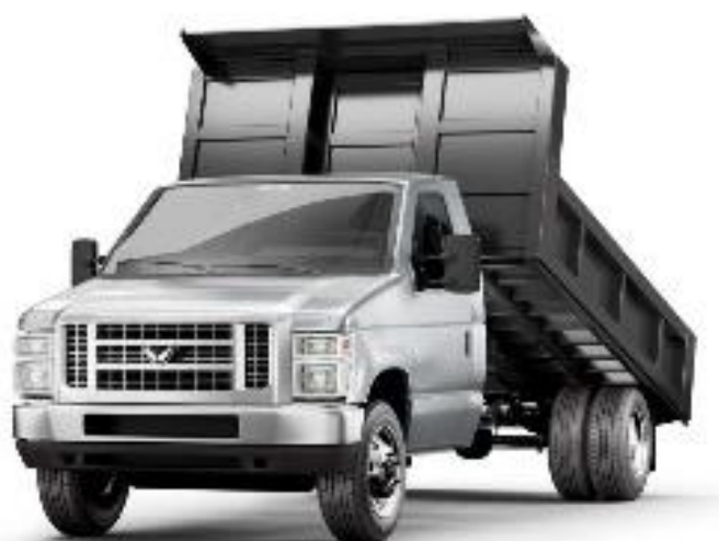
Phoenix Motorcars Dump Truck