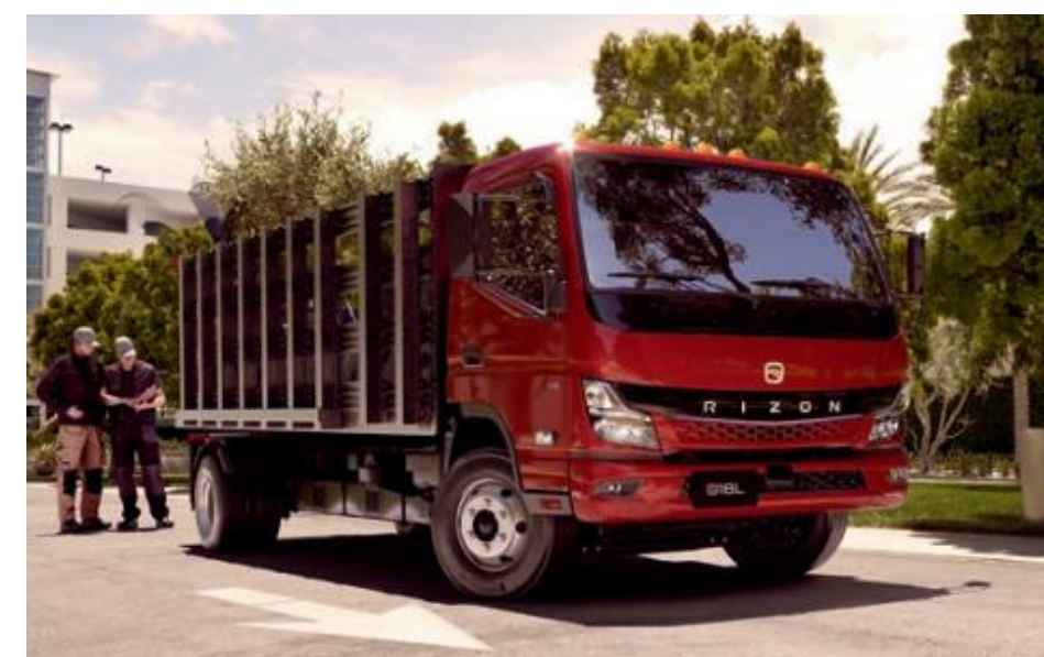
Rizon e18M Work Truck