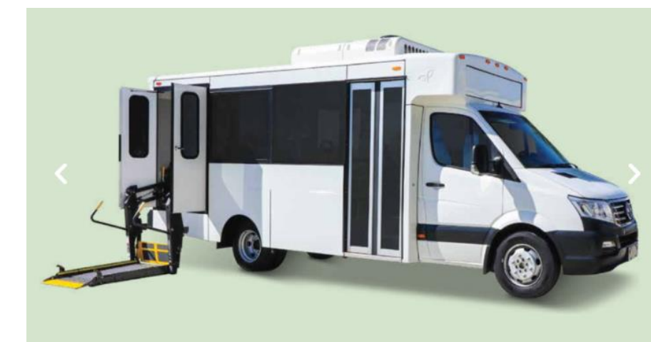
GreenPower EV Star Mobility Plus