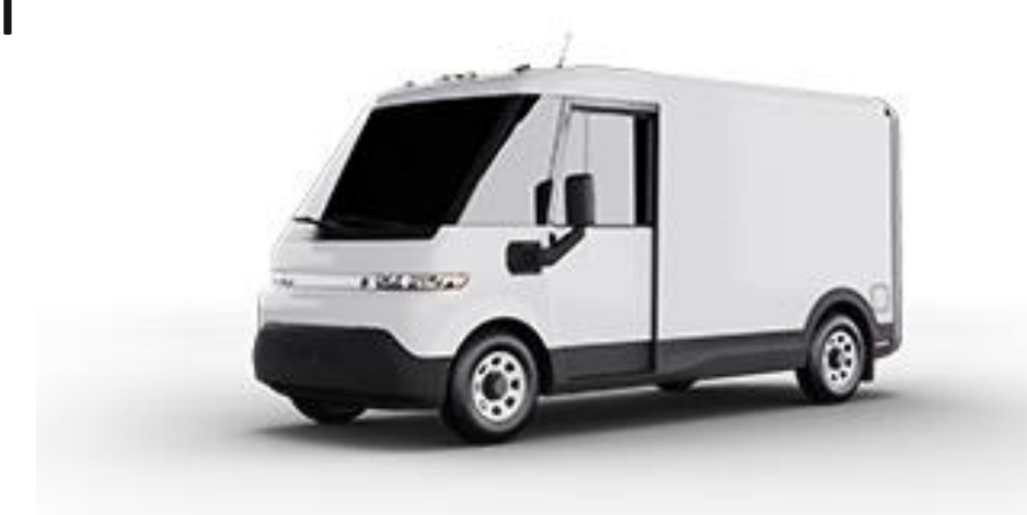
BrightDrop Zevo 400 Step Van