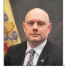
Deputy Commissioner Sean Moriarty

NEW JERSEY DEPARTMENT OF ENVIRONMENTAL PROTECTION