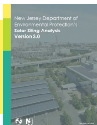
Solar Siting Analysis 3.0