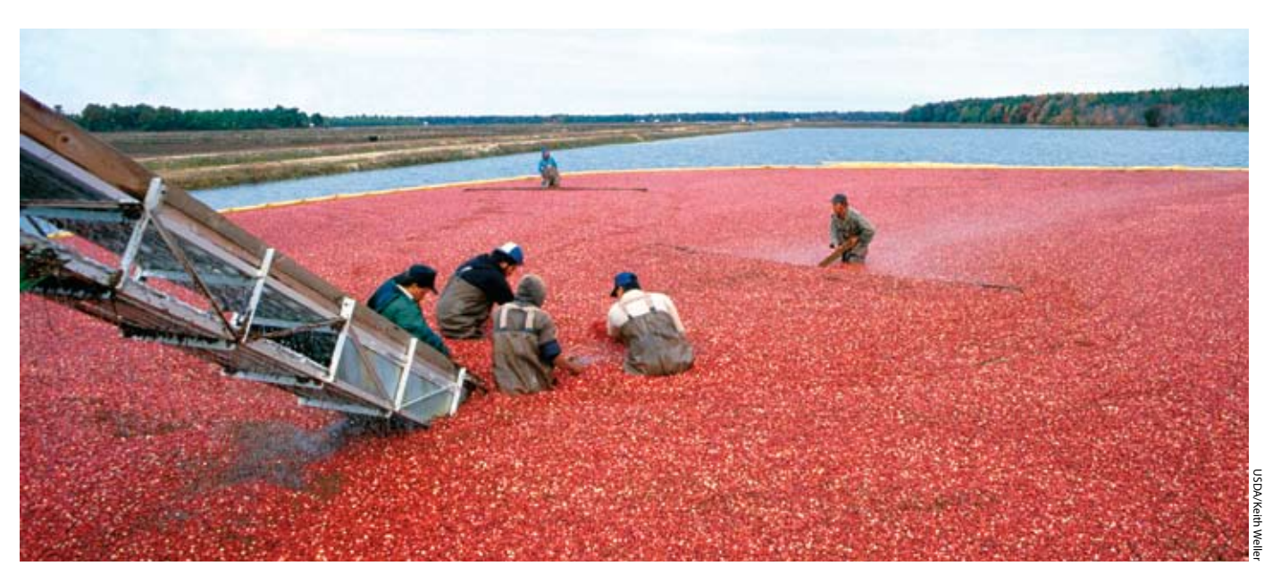
New Jersey is among the top national producers of cranberries. This crop is particularly vulnerable under either scenario, but by mid-century under the higher-emissions scenario, it is unlikely that cranberries will meet the long winter-chill periods required for optimum flowering, fruit set, and seed development in New Jersey. Unlike other fruits, no known low-chill variety of cranberry exists.

The southern part of New Jersey is dominated by the ecologically renowned Pinelands, which occupy 22 percent of the state's land area. Pitch pines and scrub oak thrive in the sandy, acidic, nutrient-poor soils, and blueberries and cranberries flourish in its bogs. These uncommon conditions have nourished a number of unique plant species and earned the Pinelands special status as the nation's first nature reserve. Under either emissions scenario, this area is likely to remain suitable habitat for pitch pines.