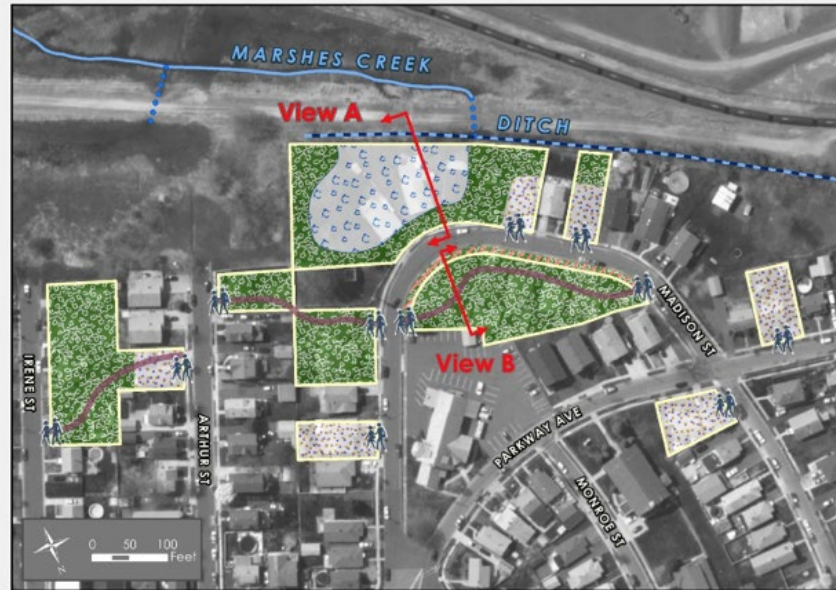
Blue Acres Proposed Design