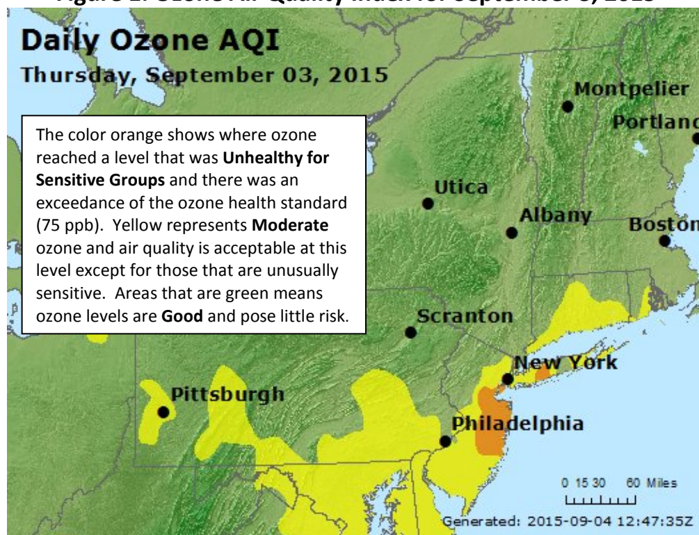
Figure 1. Ozone Air Quality Index for September 3, 2015

There is a group of monitoring stations in designated counties of 5 states, New York, Connecticut, Pennsylvania, Delaware, and Maryland, which are included in New Jersey's ozone non-attainment areas. From this group of stations in the other neighboring states, there were two (2) exceedances of the 8-hour ozone NAAQS recorded on Thursday, September 3, 2015: Susan Wagner station in Staten Island, NY with a concentration of 81 ppb and Babylon station in Long Island, NY with a concentration 76 ppb. The highest 1-hour average ozone concentration recorded was 87 ppb at the Susan Wagner station in New York, which is below the 1-hour NAAQS of 120 ppb.