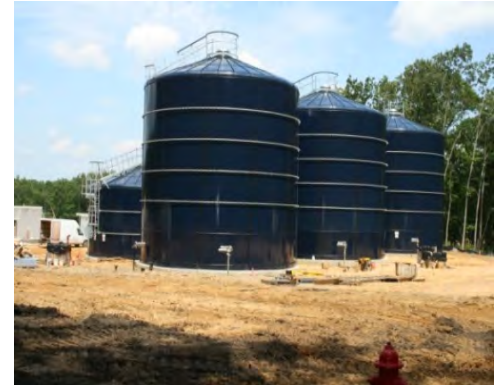
Construction of Storage Tanks at the Jackson Twp. MUA