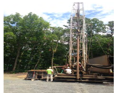
Drilling of a Drinking Water Well at the Berkeley Twp. MUA