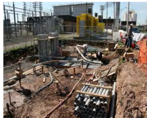
Passaic Valley Sewerage Commission Electrical Substation