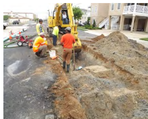
North Wildwood Sewer, Storm and Street Restoration