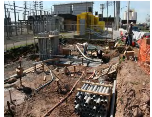
Passaic Valley Sewerage Commission Electrical Substation