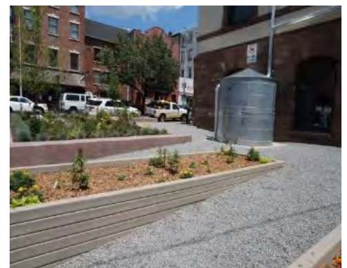
Hoboken City Green Infrastructure

NJDEP Sustainability and Green Energy Guidance (https://www.state.nj.us/dep/aqes/what-is-solar.html)