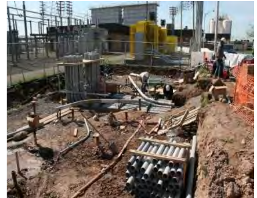
Passaic Valley Sewerage Commission Electrical Substation