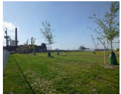
Camden County Phoenix Park

* New landfill and landfill cell construction projects that have a water quality benefit are eligible for a funding package that will consist of loan financing with a blended interest rate of 75% of the I-Bank AAA Market Interest Rate for the allowable project costs. Other landfill construction projects that have a water quality benefit are eligible for the Base CWSRF financing package.