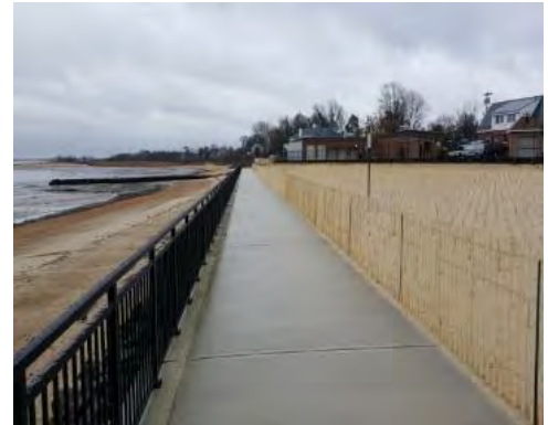
Old Bridge MUA Laurence Harbor Bulkhead and Walkway