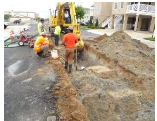
North Wildwood Sewer, Storm and Street Restoration