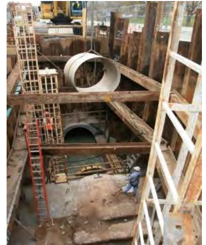
Passaic Valley Sewerage Commission Interceptor Slip Lining