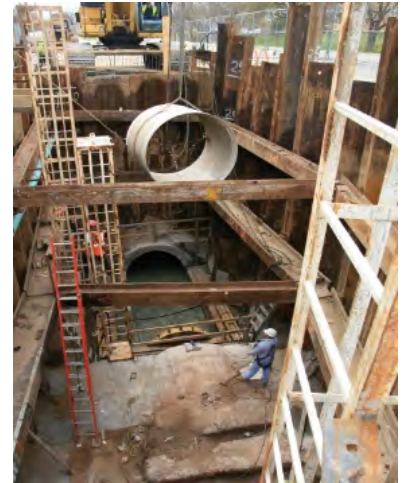
Passaic Valley Sewerage Commission Interceptor Slip Lining