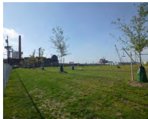
Camden County Phoenix Park

* New landfill and landfill cell construction projects that have a water quality benefit are eligible for a funding package that will consist of loan financing with a blended interest rate of 75% of the I-Bank AAA Market Interest Rate for the allowable project costs. Other landfill construction projects that have a water quality benefit are eligible for the Base CWSRF financing package.