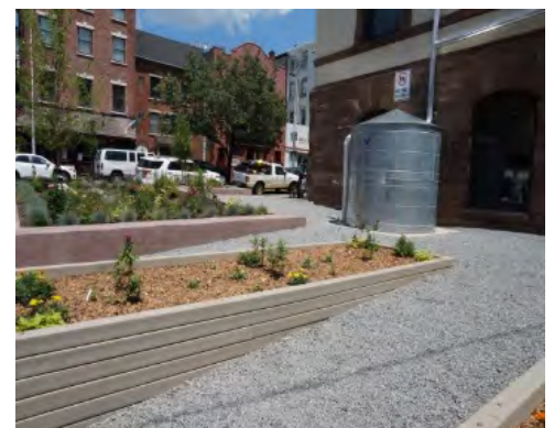
Hoboken City Green Infrastructure

NJDEP Sustainability and Green Energy Guidance (https://www.state.nj.us/dep/aqes/what-is-solar.html)