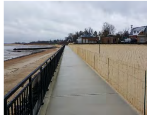
Old Bridge MUA Laurence Harbor Bulkhead and Walkway