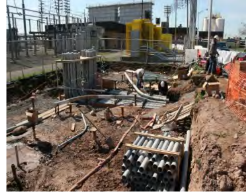
Passaic Valley Sewerage Commission Electrical Substation