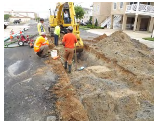
North Wildwood Sewer, Storm and Street Restoration