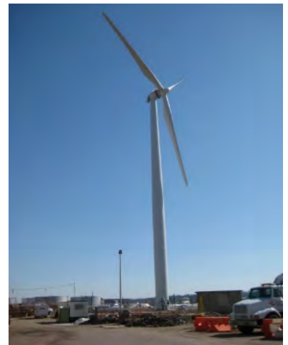
Bayonne MUA Wind Turbine for a Pump Station

For information regarding permitting, see: