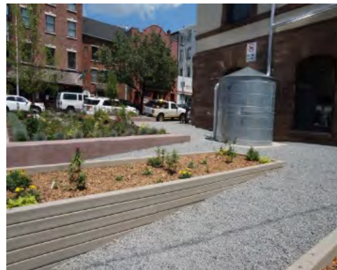
Hoboken City Green Infrastructure

(https://www.state.nj.us/dep/aqes/what-is-solar.html)