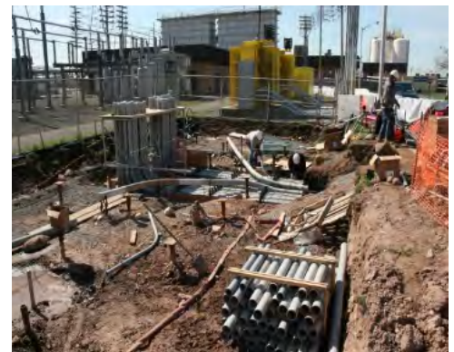
Passaic Valley Sewerage Commission Electrical Substation